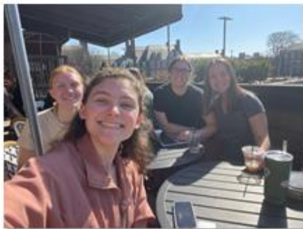
A few of our LCM students, wishing you sunny, blessed days!