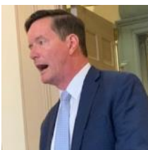
Senator Trey Paradee from Dover