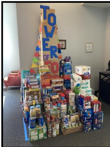
The Tower of Food 2023

Check out the Lending Library in room 128 where you'll find bible reference books and books by Christian authors with a wide range of topics. Use the sign out sheet if you want to borrow a book; when you return the book sign it in and drop it in the basket next to the book shelves.