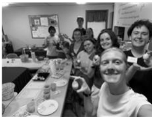
The students had a great time dyeing Easter eggs in early April!