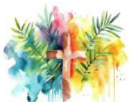
Little Ones singing on Palm Sunday