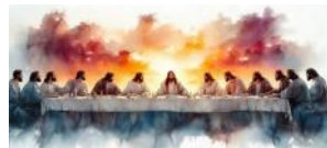
Maudy Thursday Crew